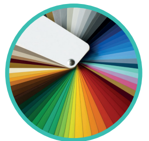
Bespoke colour options *Full range of RAL colours available