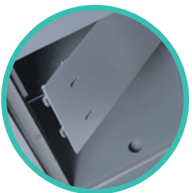
Lockable Deposit Compartments