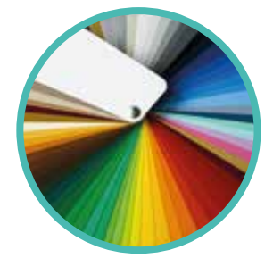
Bespoke colour options *Full range of RAL colours available